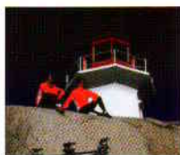
Original image A typical composition with a centred photographic subject